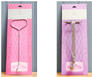
Wick Dipper: $2.50 Wick Trimmer: $10.99

Since each candle is freshly hand made by the artist, your order will be shipped in about 3 weeks to me and some of them to your hostess . Your hostess will pack them and get them to you . Order plenty of the candles for yourself and for gifts!