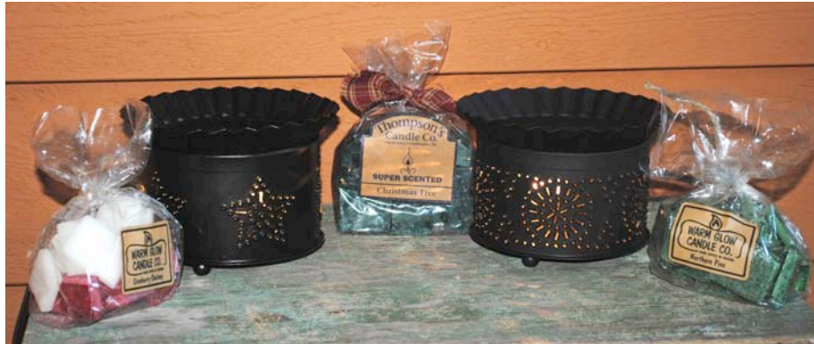
Star Design Left